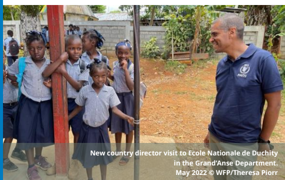
New country director visit to Ecole Nationale de Duchity in the Grand'Anse Department. May 2022