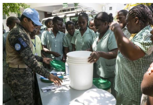
Distribution of filters to prevent water-borne diseases in Pilate

The Ministry of Public Health and Population in Haiti (MSPP) has reported 11.464 suspected cholera cases and 128 cholera related deaths from 1st January to 2nd April 2016. Even though a downward trend was observed starting from early February, the United Nations in Haiti strongly encourages all parties to remain vigilant. According to PAHO/WHO and UNICEF’s experts, extreme vulnerability to cholera persists in many areas of the country and outbreaks can spark in any department, often due to internal displacements of people moving from the most affected areas, as well as other external factors, such as accentuated water scarcity due to 3 years of drought (which can force people to use non-potable water), localized and short heavy rainfall, and the political situation, since instability may hinder local response and Government capacity.